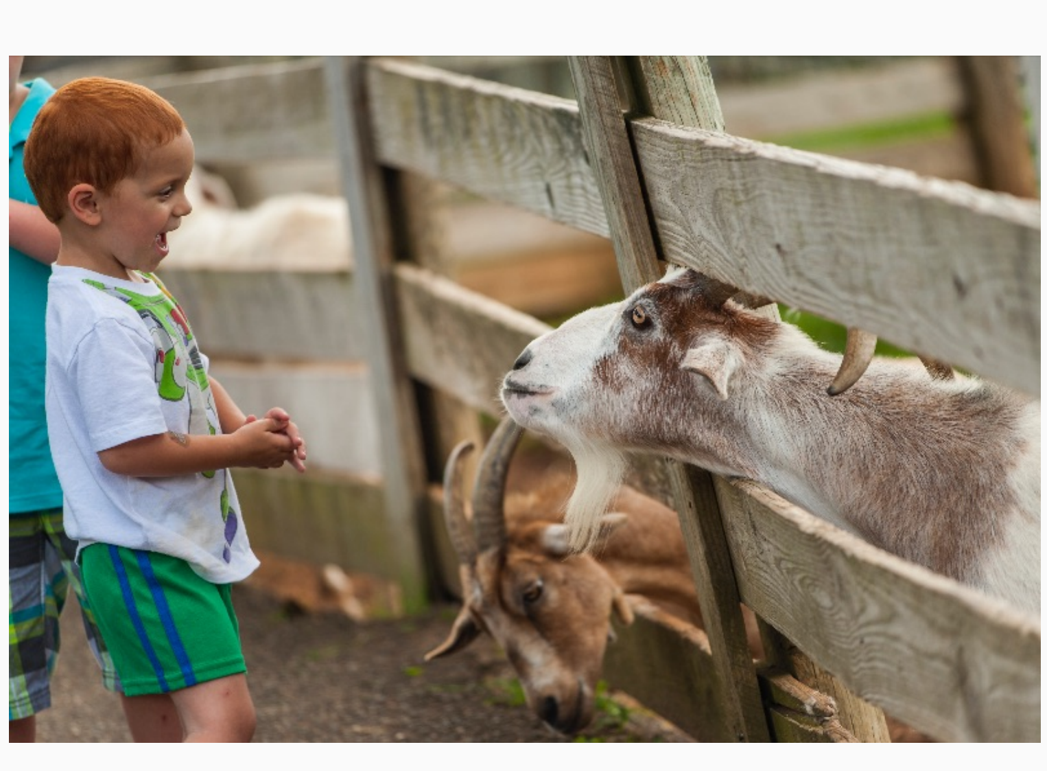
Maymont Farm lets kids learn about animals and nature - up close!